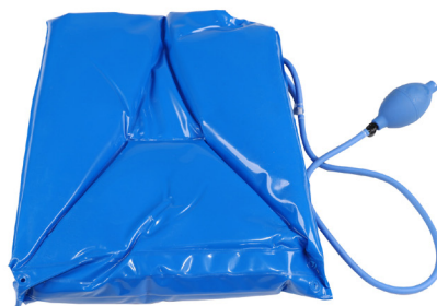
S342418 Replacement Part - Royale Pressure Relieving Highback/Lowback Chair Air Bladder (With Handpump & Tube) Wide