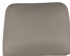
S342422 Replacement Part - Royale Pressure Relieving Lowback Chair Backrest Wide