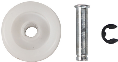
S342431 Replacement Part - Royale Pressure Relieving Highback/Lowback Chair Wheel For Rear Leg Each