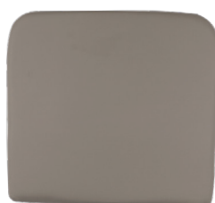
S342423 Replacement Part - Royale Pressure Relieving Highback/Lowback Chair Seat Pad Standard