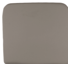
S342424 Replacement Part - Royale Pressure Relieving Highback/Lowback Chair Seat Pad Wide