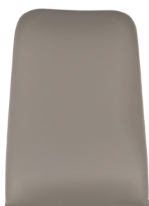
S342419 Replacement Part - Royale Pressure Relieving Highback Chair Backrest Standard