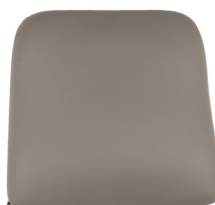
S342421 Replacement Part - Royale Pressure Relieving Lowback Chair Backrest Standard