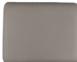
S342433 Replacement Part - Royale Pressure Relieving Legrest Pad