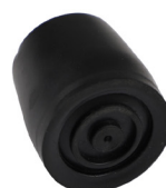
S342435 Replacement Part - Royale Pressure Relieving Legrest Leg Rubber Tip Each