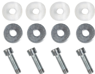
S342432 Replacement Part - Royale Pressure Relieving Highback/Lowback Chair Installation Screw Sets Each