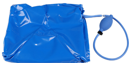
S342417 Replacement Part - Royale Pressure Relieving Highback/Lowback Chair Air Bladder (With Handpump & Tube) Standard