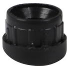
S342427 Replacement Part - Royale Pressure Relieving Highback/Lowback Chair Rubber Tip For Front Leg Each