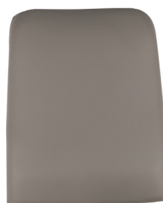
S342420 Replacement Part - Royale Pressure Relieving Highback Chair Backrest Wide