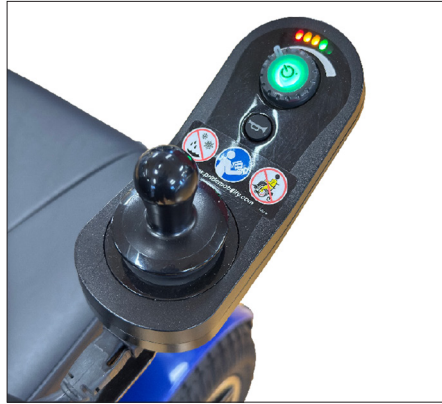
Dynamic Linx Joystick Controller