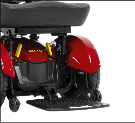
Flip Up Foot Board