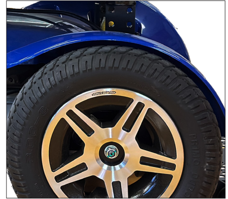
14" Solid Front Drive Wheels