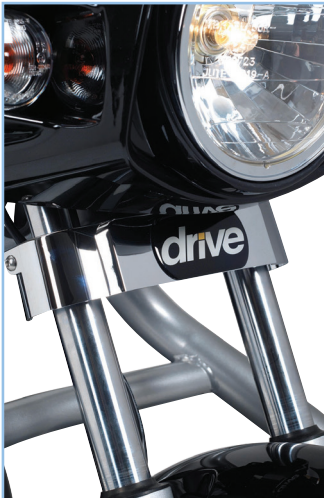
Telescopic front motorcycle suspension for optimal handling