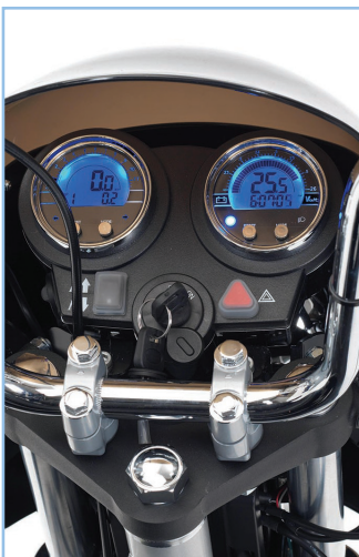
Twin dial digital dash