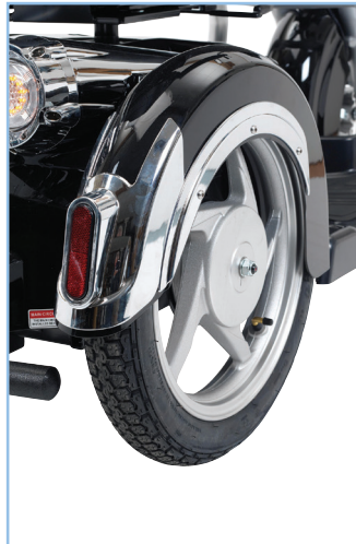
Motorcycle style wheels with chrome mud guards