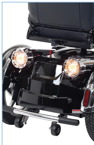
All round lighting