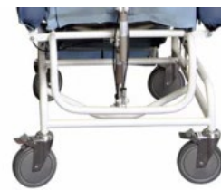
3 Brake & 1 Directional Castor