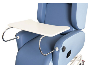
Optional Tray Table