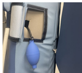
Adjustable Air Cell