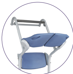
Comfortable Swing-Away Seat Pads