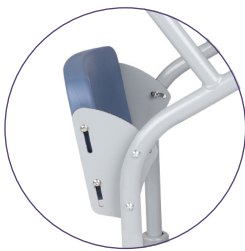
Padded Lower Knee Support