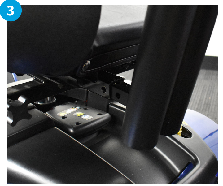
Adjust length to fit the scooter