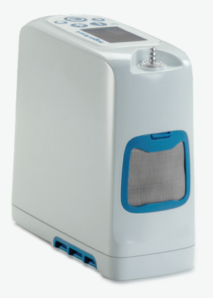
Inogen® Rove 6™ Portable Oxygen Concentrator (Catalog Number IO- 501)