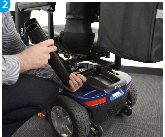
Insert the cane holder to the side adapter attached to the L piece