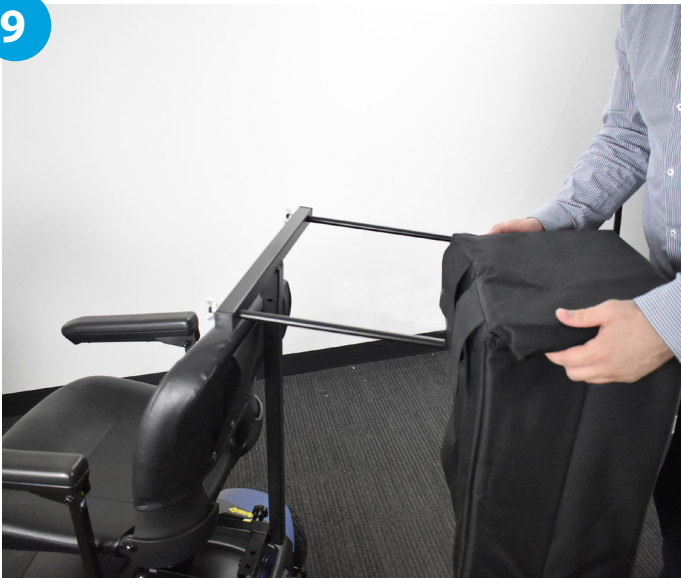
Take the bag and align the poles into the rounded out material at the top ends of the bag