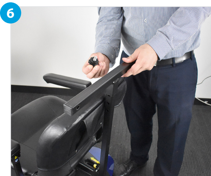
6 Secure with screw