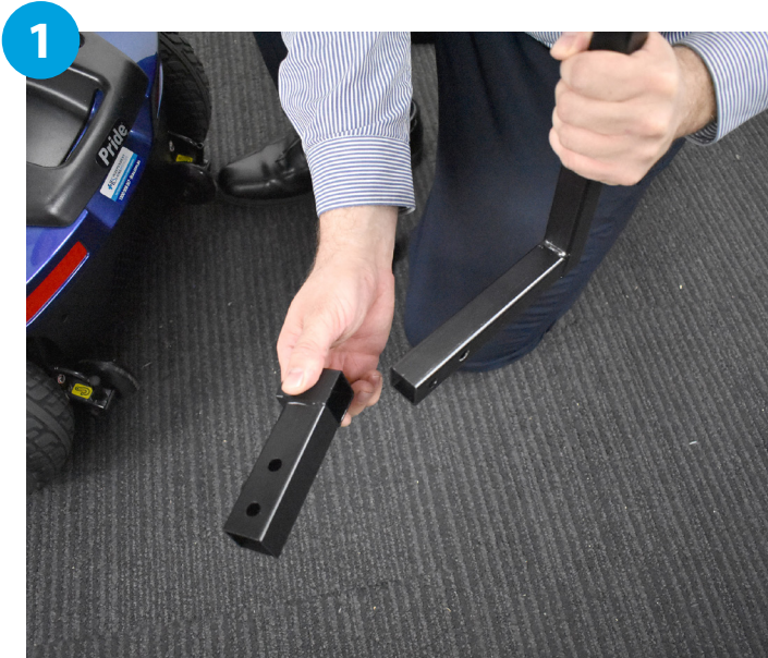
1 Take side adapter and attach to the bottom of the L piece