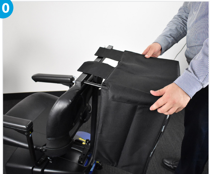
Position bag toward the frame as far as it can