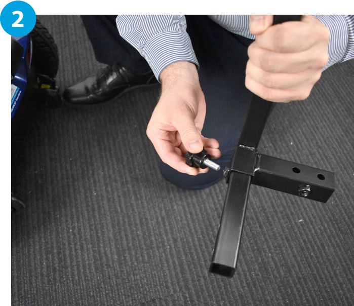
2 Move side piece to the corner of the L piece and secure with screw