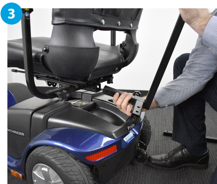
3 Attach the L piece to the rear receiver on the scooter