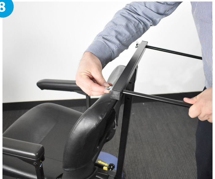
Repeat the last step for the other side