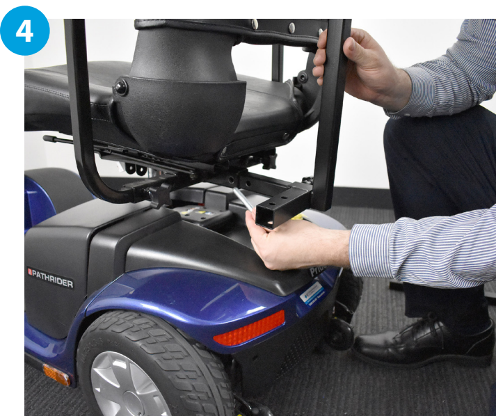
4 Secure with screw or metal pin