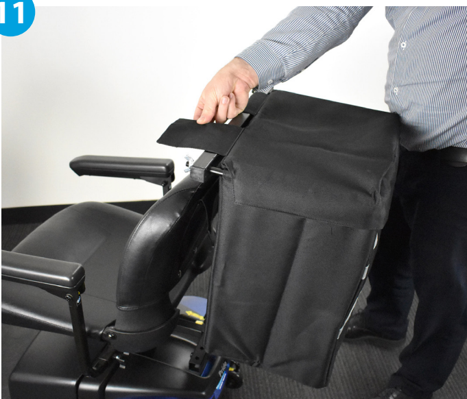
Using Velcro straps attach the bag to the T piece