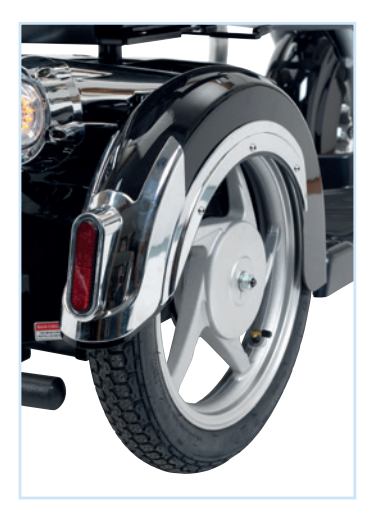
Motorcycle style wheels with chrome mud guards