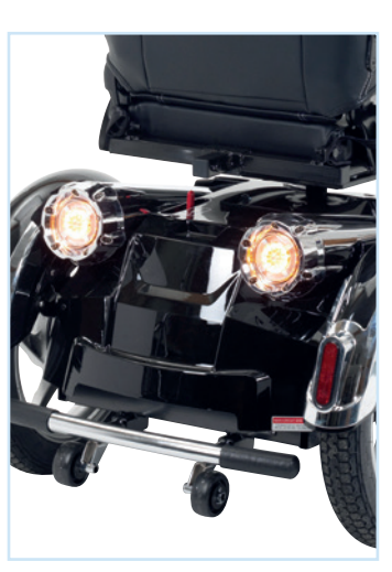
All round lighting