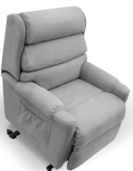
Petite (Optima only)