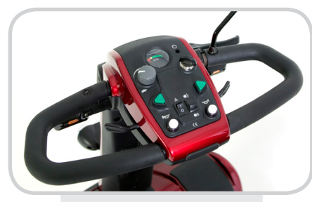
Easy-drive tiller with wraparound handles